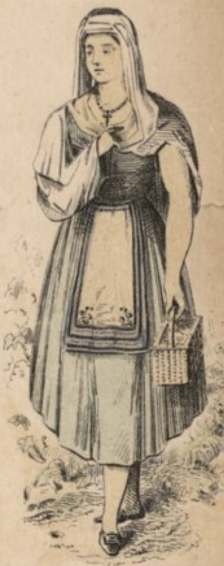
FEMALE OF STMICHAELS.