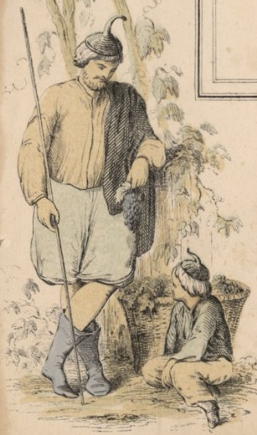
PEASANT OF MADIRA.