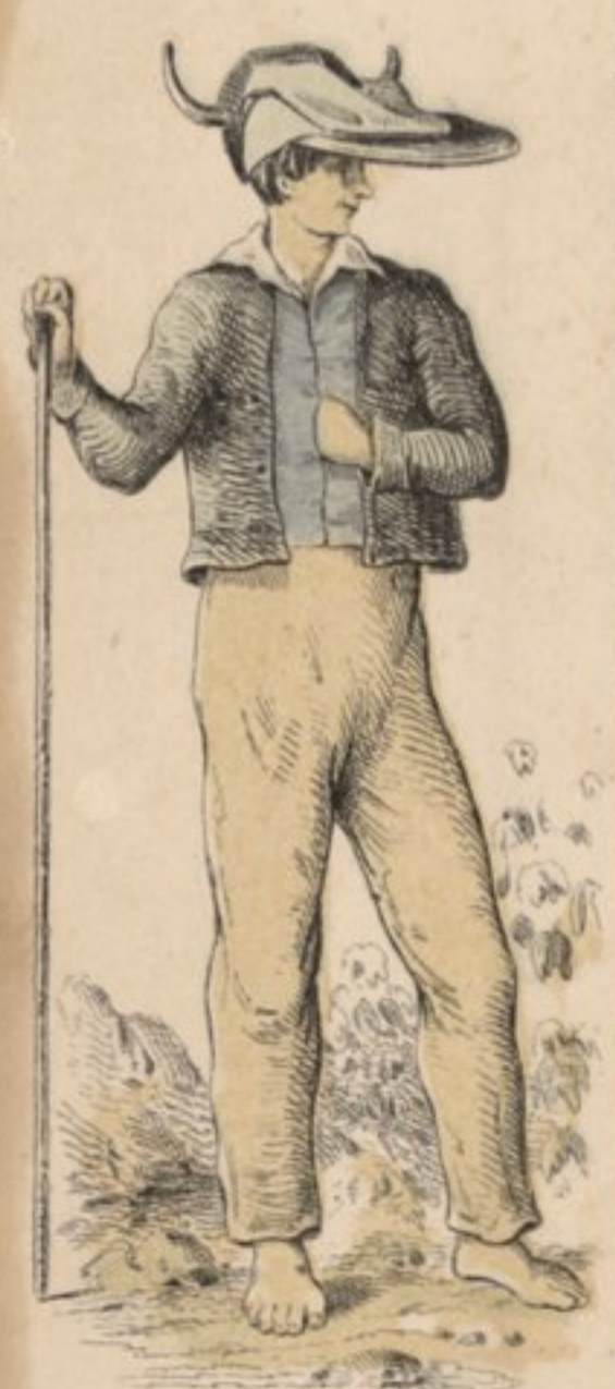
PEASANT OF STMICHAELS.