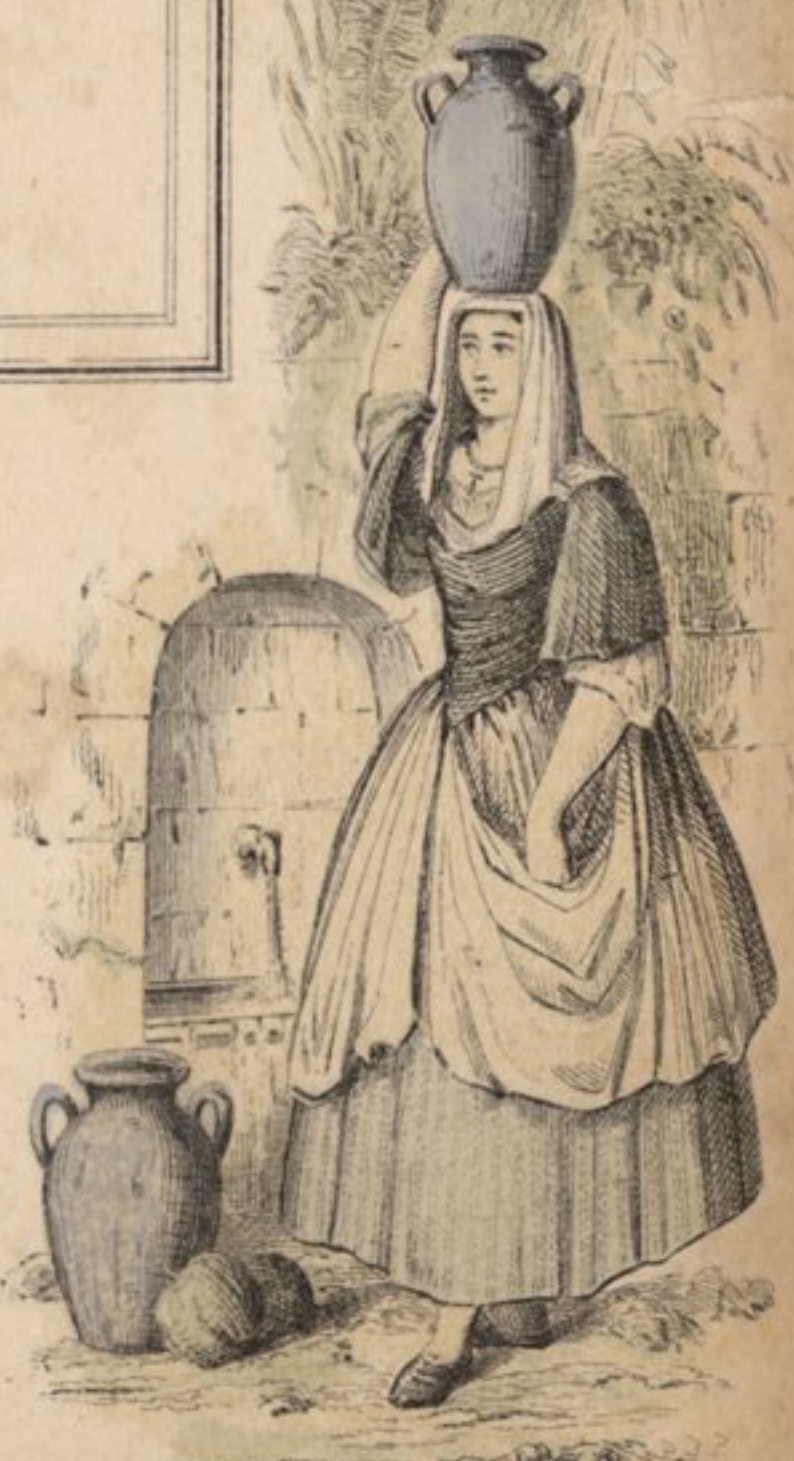
FEMALE OF MADEIRA.