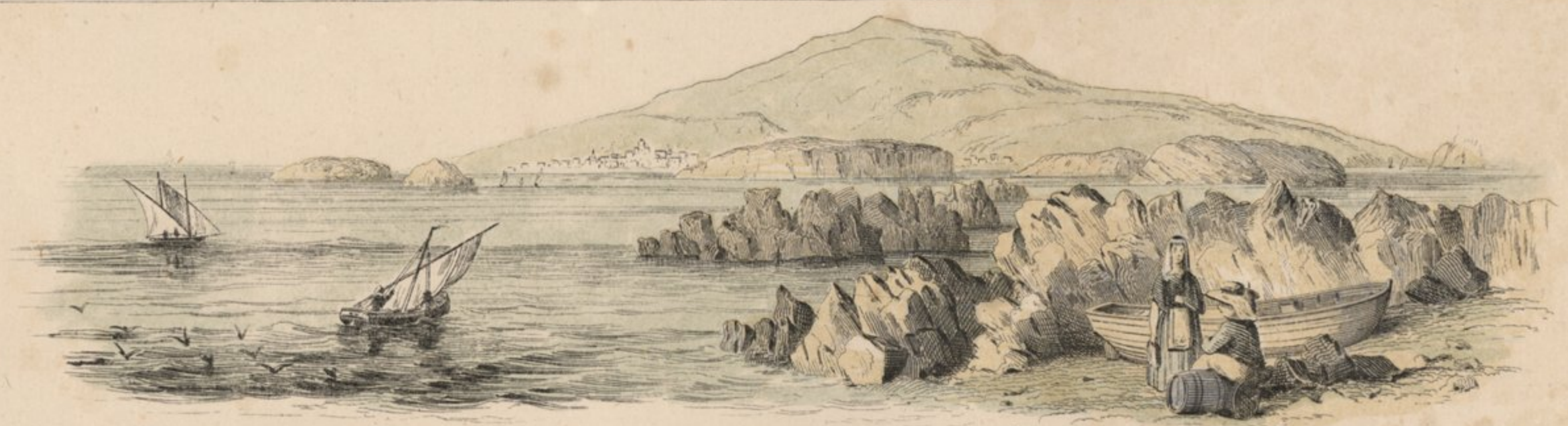
ISLAND OF FAYAL FROM PICO.—AZORES.