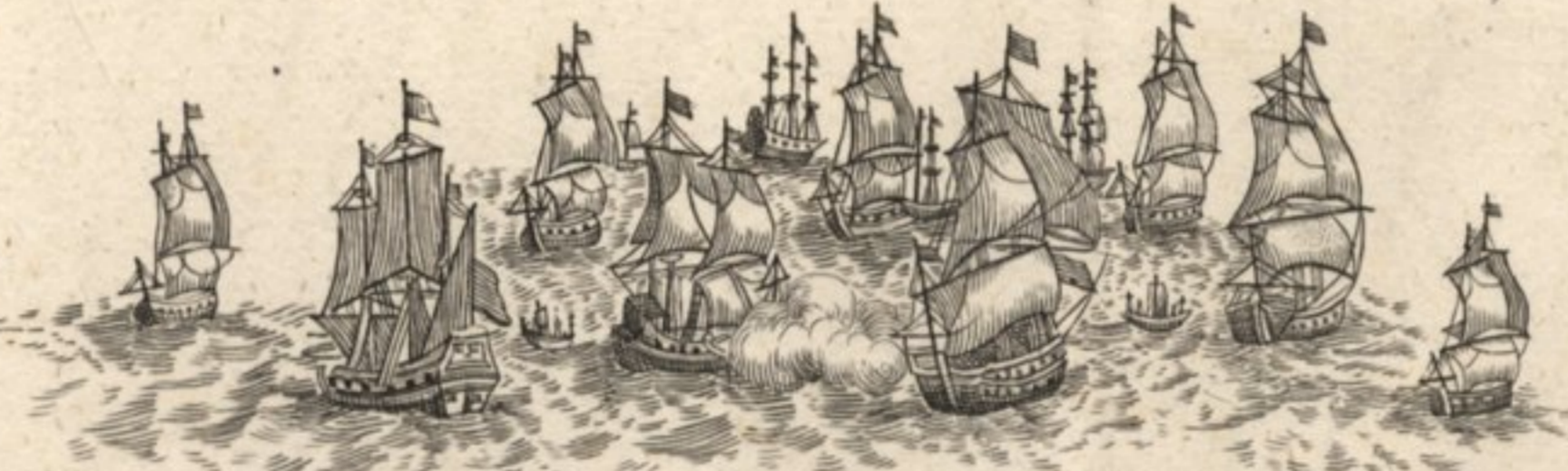
CAROLUS III. Hispaniæ Rex Archidux Austriae. Ex Angliâ Hispaniam petens, Eboracum navigavit die 21 Febr. 1704.

Benevole Spectator advertite Portugallie Regni potentiam in quatuor Orbis partibus esse firmatam. Nam in EUROPA possidet Portugalliam & Algarbiam. In AFRICA Sarracenos & ultimum lateris Oceani Regna Congo Loango Angolam Mozambique Malindam, Zanzibar & Quilom. partem Guineæ. Involat Cap. Verde. Apurdis, Rio Fluminis, Madagascariam, Anthon. S. Thomæ, S. Pauli. In ASIA præcipuum Muscat. in Orientibus Indis Coam, Diu & Macao. In AMERICA denique Braxiliam, Præsentis Portugallie Regis Insulam Præcipuum, longè præcipuum.